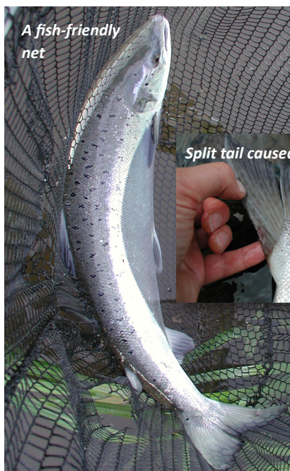
A fish-friendly net

Fish should be played quickly and as firmly as possible so that they can be released before becoming too exhausted.